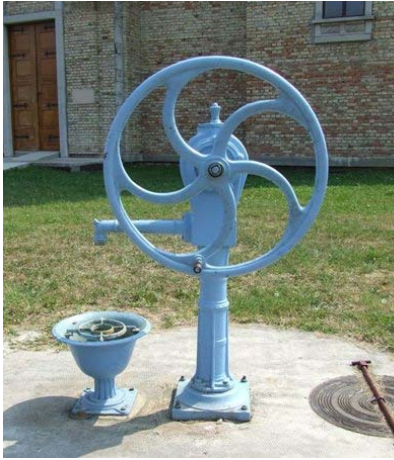
Novi Sad Novo naselje

Last years, duration of rotation was examined for various kinds of wheels, flywheels, disks, gears and belts due to inertia.