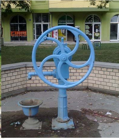
Petrovaradin Preradovic street

Water pumps with massive wheel – flywheel from cast iron: rotation lasted 2-3 seconds.