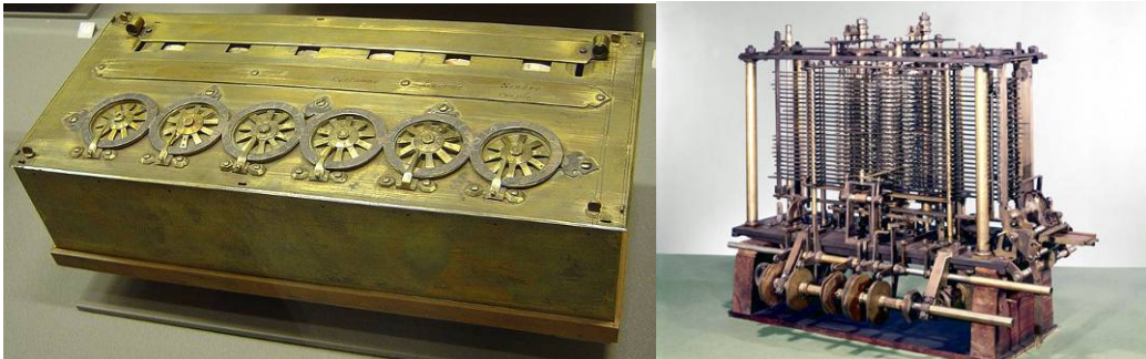
Mechanical calculators and mechanical computers from previous centuries are deserved for development of the electronic computers

Besides that a thesis can be envisaged about filling up emptiness in development of techniques by application of a driving pendulum, new mechanical ideas can accomplish development in other areas of the science and the technology.