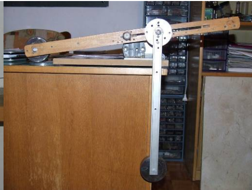
Mechanical hammer with a pendulum